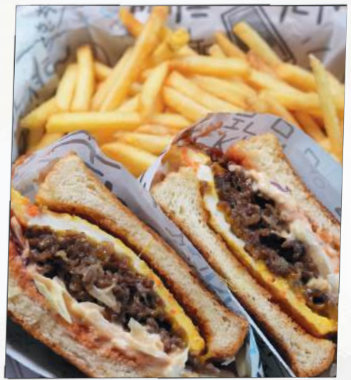
Beef Bulgogi Toast + French Fries

*FRENCH FRIES AND A SOFT DRINK ARE INCLUDED IN THE KOREAN TOAST COMBO PRICE.