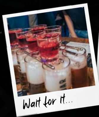
Wait for it...