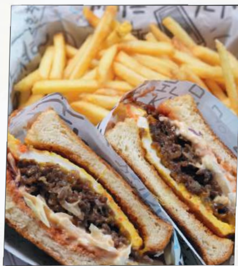
Beef Bulgogi Toast + French Fries

*FRENCH FRIES AND A SOFT DRINK ARE INCLUDED IN THE KOREAN TOAST COMBO PRICE.